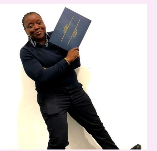
Figure 1 FARUG congratulates you upon this achievement!

FARUG Executive director completes her Human Rights Advocacy programme 2019 at the Colombia University in New York, USA. This will not only contribute to her development in her advocacy carrier and passion but a fundamental development to the entire LGBTIQ community.