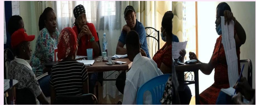
Figure 1 Staff and peers learning about OraQuick HIV Self – testing kit

Peers and staff were taken through the procedure of using this kit and they can now educate their peers on how to use the self-test kit. The introduction of this self-test kit is intended to supplement the fight against HIV infection and increase awareness of one's status.