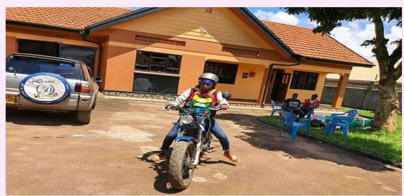
Figure 1 FARUG peer setting off to distribute Condoms and self-testing kits to fellow

the implementation of most planned activities. FARUG, in the struggle to keep her members healthy and informed, has put a number of interventions. These include continued distribution of condoms to communities to pre vent HIV and STI infections, sensitizations and education of peers on sexual and reproductive health rights through social media platforms, distribution of OraQuick self-testing kits. We have continued providing food support packages as well as promoting a market place in our Whatsapp group to help members with economic empowerment during COVID-19.