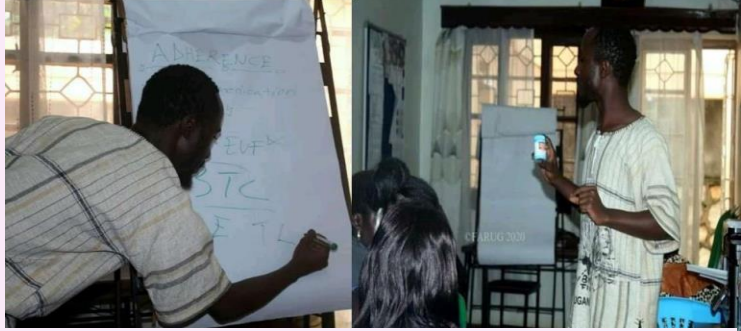
Figure 1 The E.D Men of the Night giving mechanisms of effective adherence to LBQLHIV.

As a measure of helping our members adhere to HIV treatment, FARUG conducts quarterly meetings for LBQ women living with HIV. These meetings are aimed at members sharing how they are copying with antiretroviral treatment (ART) administration as well as encouraging others to live positively. The first quarterly meeting was facilitated by Men of the Night Executive Director. Members discussed a variety of issues related to proper adherence to their ARTs.