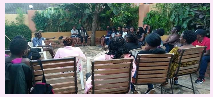
Figure 1 FARUG members in a learning conversation