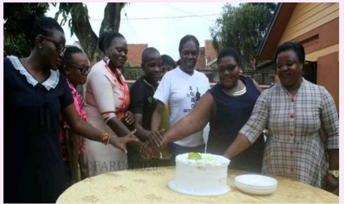
Figure 2 Cutting of the cake to appreciate peers.

We reached districts such as; Arua, Busia, Jinja, Kayunga, Mbarara, Lira, Gulu, Kampala, Wakiso, Butambala and many more. The implementation of this project has bred many more impactful projects such as adherence quarterly meetings, online counselling, DIC etc. that have continued benefiting the entire LGBTQ community.