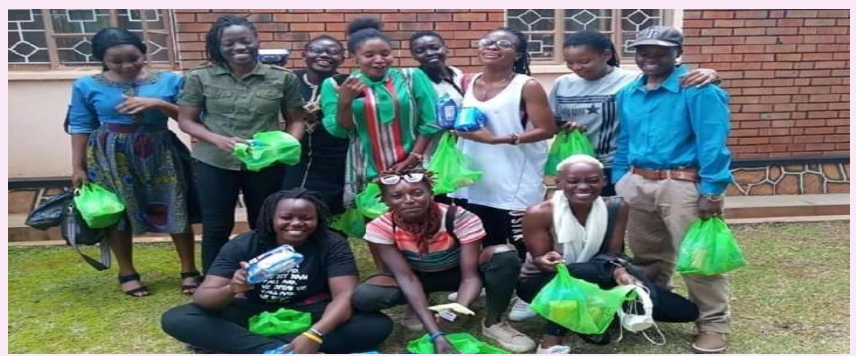
Figure 1 Happy members after receiving their packages!

Member were given menstrual and intimate care products to take them through the festive season.