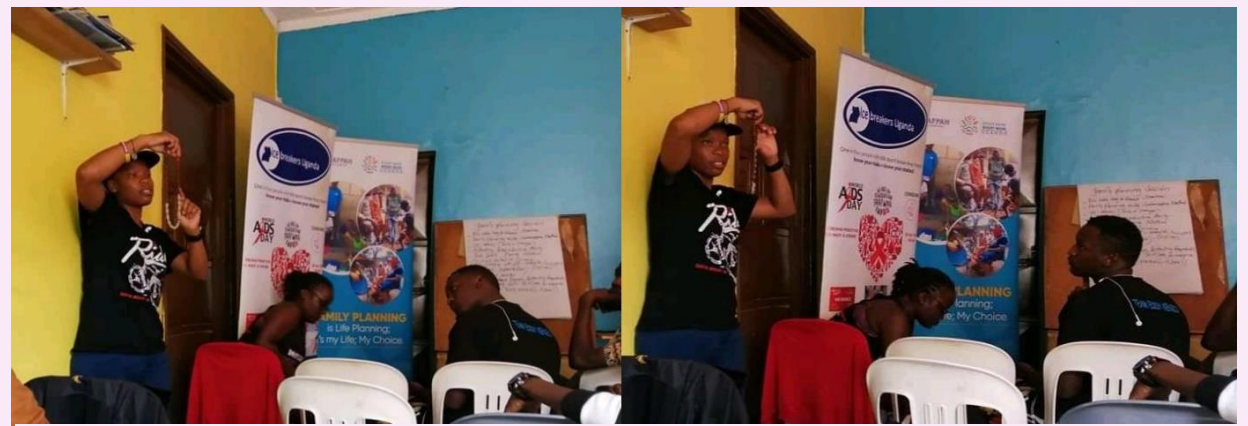
Figure 2 One of the FARUG nurses doing their best! Demonstration of moon bead method of family planning.

Our health coordinator demonstrating the safe day's method of family planning (moon bead method) during one of our clinic days at Ice breakers Uganda.