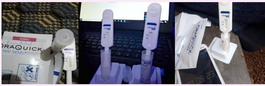
Figure 2 KPs have managed to self-test at their places of convenience and awaiting their results